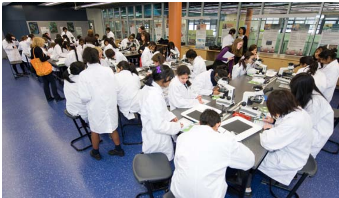
Right: scientists and teachers look on while the students monitor their growing zebrafish.

Now a professorial fellow at Monash University, she will also talk to the students a few days after the BioEYES workshop.