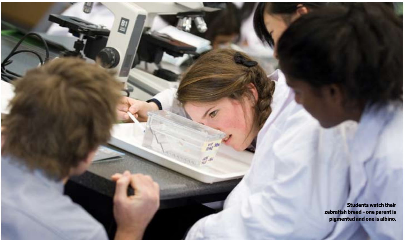
Students watch their zebrafish breed - one parent is pigmented and one is albino.